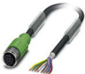
Sensor/actuator cable, 8-position, PUR halogen-free, black-gray RAL 7021, shielded, free cable end, on Socket straight M12, A-coded, cable length: 5 m

Please be informed that the data shown in this PDF Document is generated from our Online Catalog. Please find the complete data in the user's documentation. Our General Terms of Use for Downloads are valid ( http://phoenixcontact.com/download )