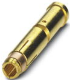
Crimp contact, turned, contact diameter: 2 mm, crimp range: 0.25 mm 2 ... 1 mm 2

Please be informed that the data shown in this PDF Document is generated from our Online Catalog. Please find the complete data in the user's documentation. Our General Terms of Use for Downloads are valid ( http://phoenixcontact.com/download )