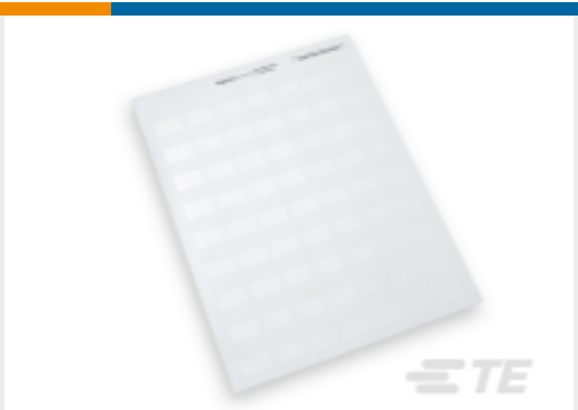
TE Part #9-1768016-1 CSL-06925P-9