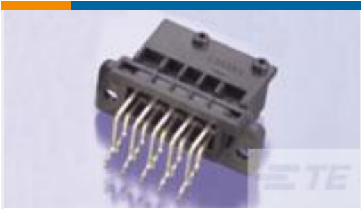
TE Part #2-963215-1 16P STIFTWANNE 3MM