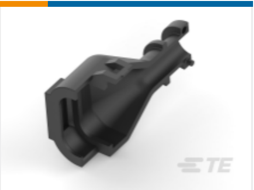
TE Part #2138529-1 STRAIN RELIEF,8 POSITION AMPSEAL