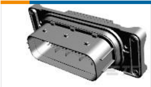
TE Part #1-1418362-3 62 POS MIXED HEADER CODA