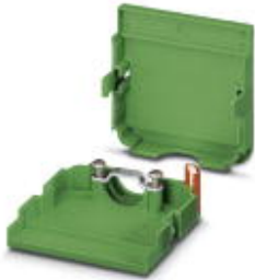
Cable housing, pitch: 3.81 mm, number of positions: 8, dimension a: 32.87 mm, color: green

Please be informed that the data shown in this PDF Document is generated from our Online Catalog. Please find the complete data in the user's documentation. Our General Terms of Use for Downloads are valid ( http://phoenixcontact.com/download )