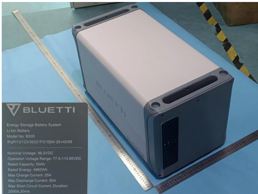
Photo 1 电池组正面 Front view of battery