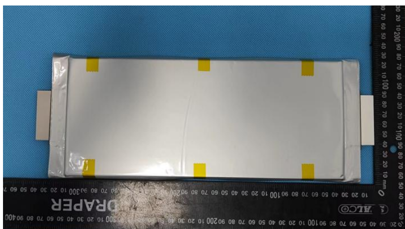
Photo 4 电池背面 Back view of Cell