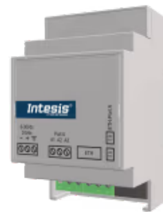
Modbus RTU to Modbus TCP - 32 devices

Integrate devices in a Modbus RTU network with a Modbus TCP network transparently with our compact Modbus Router. This integration aims to make Modbus RTU devices, registers, and resources accessible to a Modbus TCP client BMS or controller.