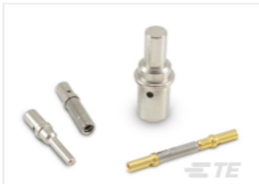
TE Part #CAT-D48-ST273 DEUTSCH Connector Solid Contacts