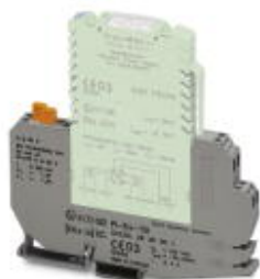
Ex base terminal block for intrinsically safe signals with knife disconnection and test connections

Please be informed that the data shown in this PDF Document is generated from our Online Catalog. Please find the complete data in the user's documentation. Our General Terms of Use for Downloads are valid ( http://phoenixcontact.com/download )