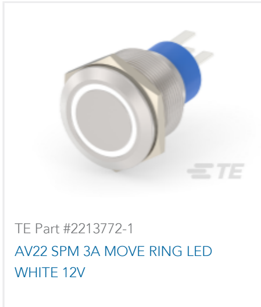
TE Part #2213772-1 AV22 SPM 3A MOVE RING LED WHITE 12V