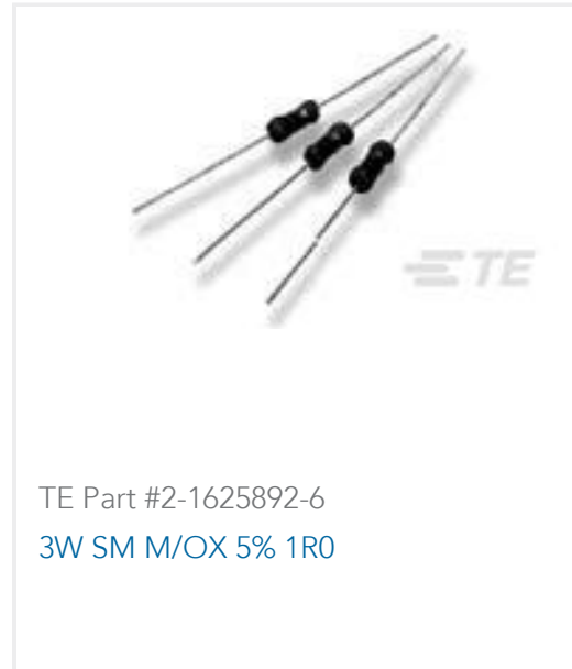
TE Part #2-1625892-6 3W SM M/OX 5% 1R0