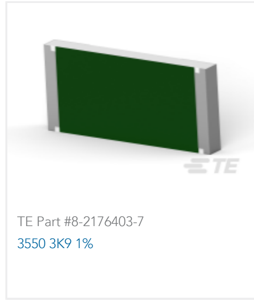
TE Part #8-2176403-7 3550 3K9 1%