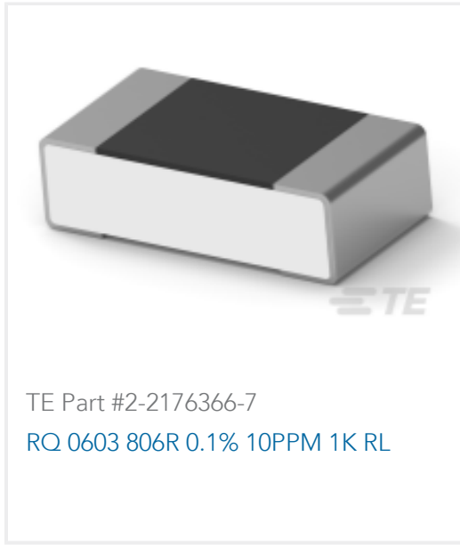
TE Part #2-2176366-7 RQ 0603 806R 0.1% 10PPM 1K RL