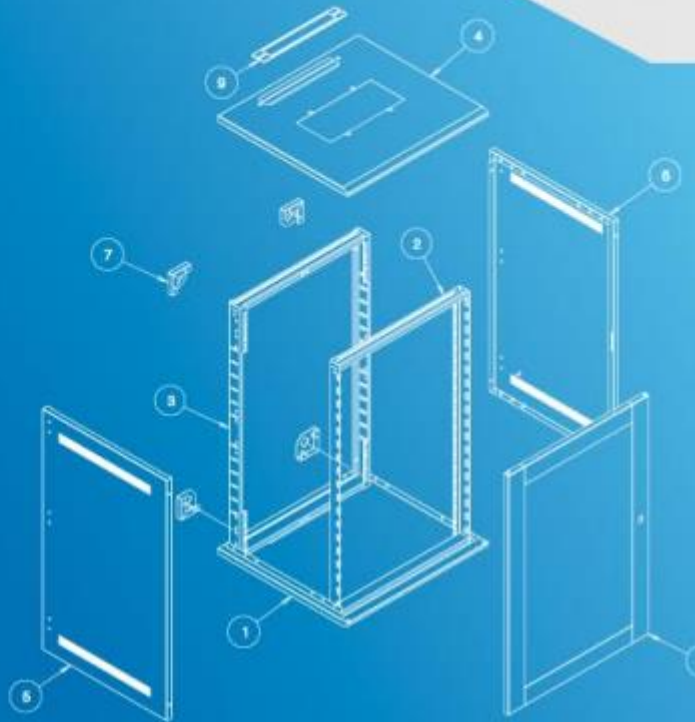
ISOMETRIC VIEW AND DIMENSIONS OF 6U WALLNET