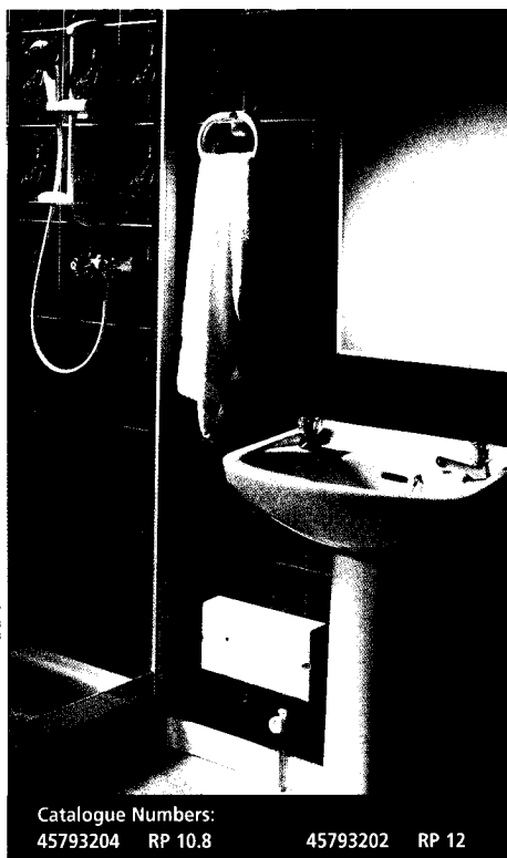
Powerstream used to supply hand wash basin and shower mixer

The highest rated single phase water heater in the UK market. An adaptable unvented instantaneous water heater with multi - directional mounting.