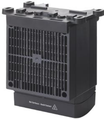
PTC w. thermostat Wall mounting fan heater CS130 120 V AC, 1200 W