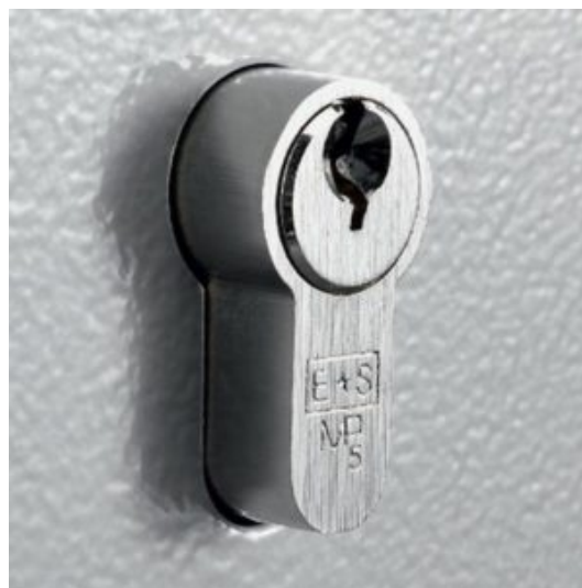
Euro Profile Cylinder