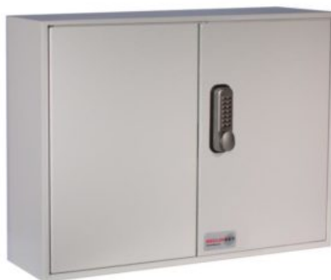
Key Vault 600 Push Button Combination Lock