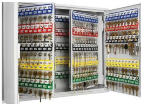
Key Vault Interior