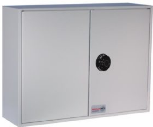
Key Vault 600 Dial Combination Lock