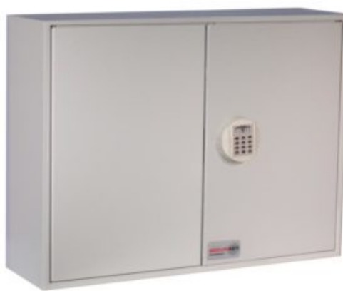
Key Vault 600 Electronic Lock REVO A