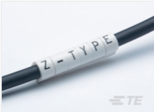
TE Part #EC0051-000 05801911