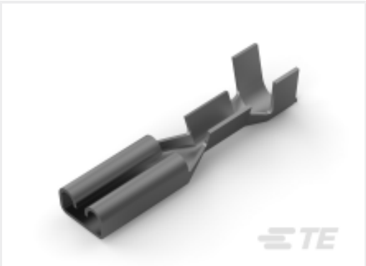
TE Part #150346-2 110 MINI FASTON,REC.,24-20 AWG, TPBR