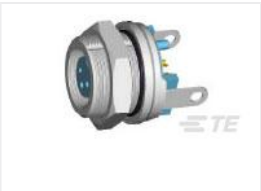
TE Part #9-1437719-6 T01-0580-S03-FEMALE REC PANEL MNT SOLDER