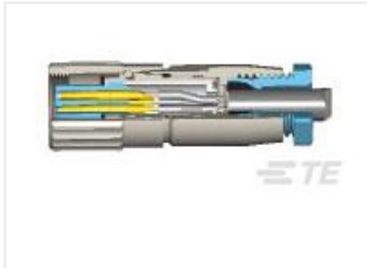
TE Part #3-1437719-0 T01-0550-S03-FEMALE PLUG CONNECTOR SOLDE