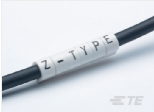
TE Part #EC0053-000 05801913