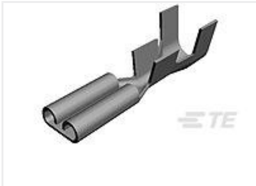
TE Part #41969-2 250 FASTON REC 22-18 AWG BR