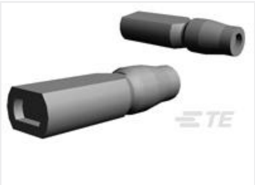
TE Part #2-180930-0 250 FASTON HSG.,REC.,1 POS, NATRUAL