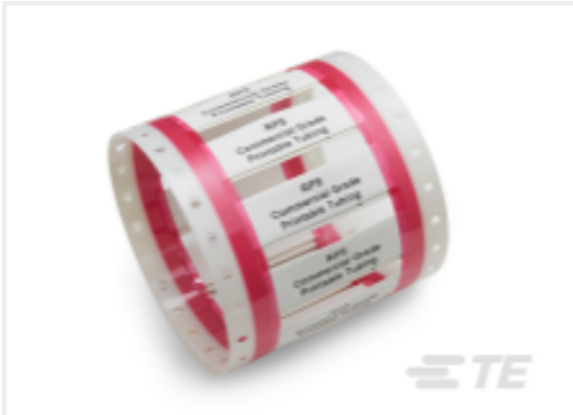
TE Part #CAT-T3437-R819 RPS Commercial Grade Sleeves