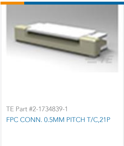
TE Part #2-1734839-1 FPC CONN. 0.5MM PITCH T/C,21P