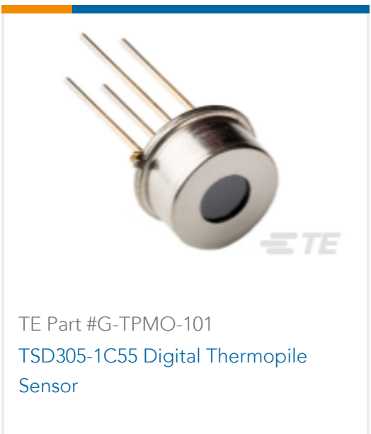
TE Part #G-TPMO-101 TSD305-1C55 Digital Thermopile Sensor