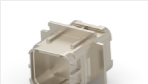
TE Part #CAT-DMC-MD-26 Rectangular Connector Receptacle Extenders, Tool-less Assembly