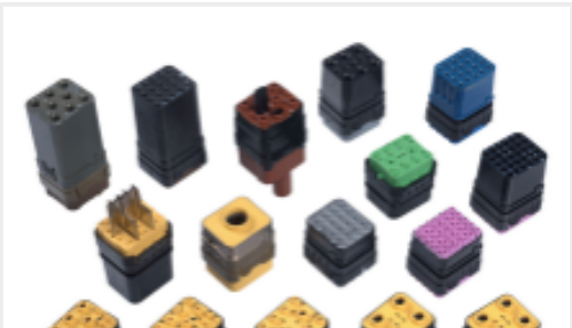
TE Part #ZPF000000000148762 DMC-M 99-04 AN (=33537-P0000)