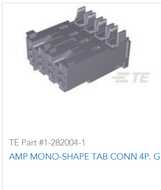
TE Part #1-282004-1 AMP MONO-SHAPE TAB CONN 4P. G