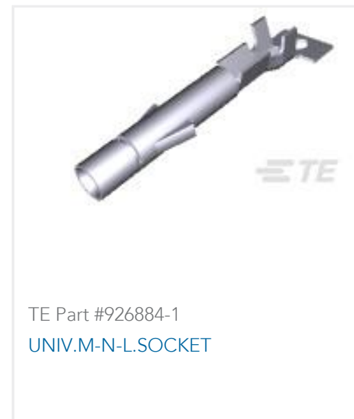
TE Part #926884-1 UNIV.M-N-L.SOCKET