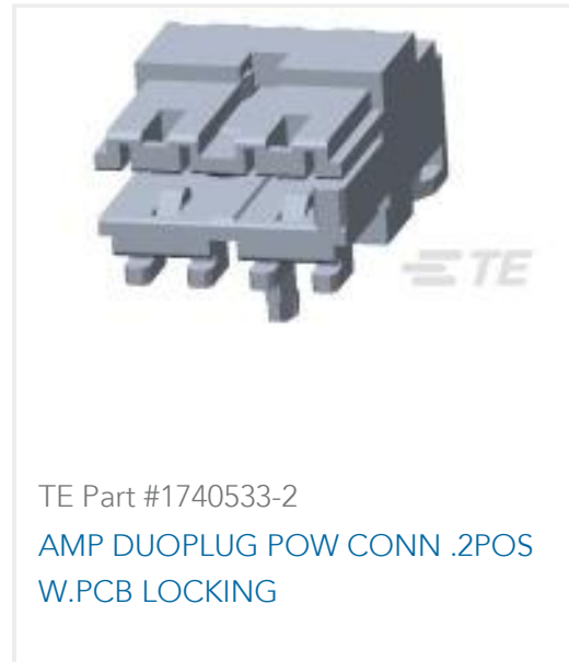
TE Part #1740533-2 AMP DUOPLUG POW CONN .2POS W.PCB LOCKING