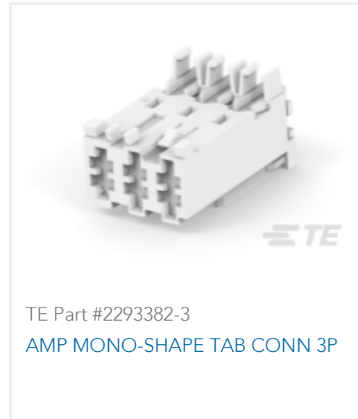
TE Part #2293382-3 AMP MONO-SHAPE TAB CONN 3P