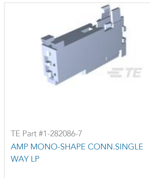
TE Part #1-282086-7 AMP MONO-SHAPE CONN.SINGLE WAY LP