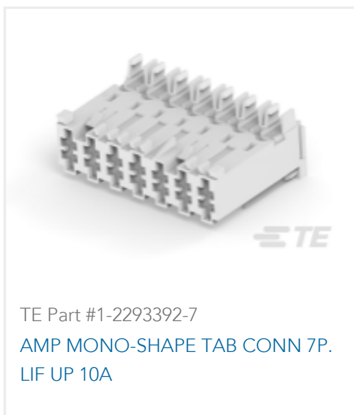
TE Part #1-2293392-7 AMP MONO-SHAPE TAB CONN 7P. LIF UP 10A