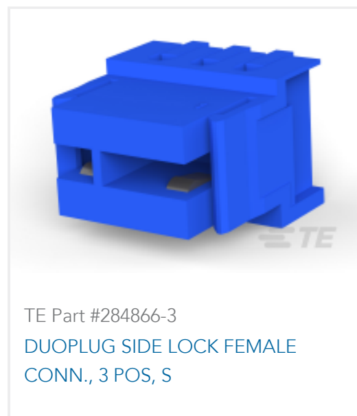
TE Part #284866-3 DUOPLUG SIDE LOCK FEMALE CONN., 3 POS, S