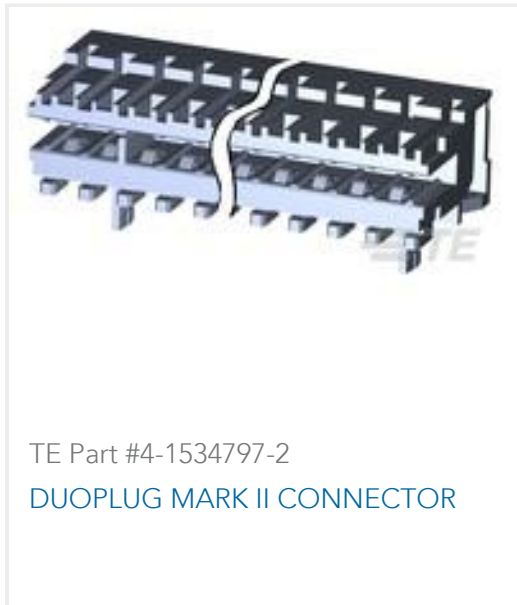
TE Part #4-1534797-2 DUOPLUG MARK II CONNECTOR