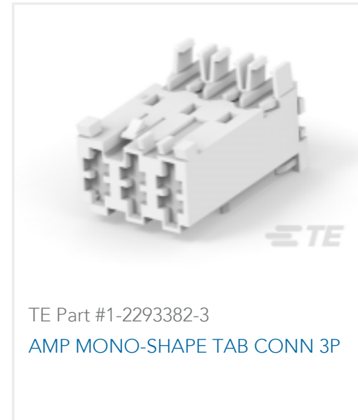
TE Part #1-2293382-3 AMP MONO-SHAPE TAB CONN 3P