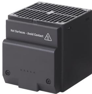
Semiconductor heater unit CSL 028 250 W, 120 V AC clip attachment, UL