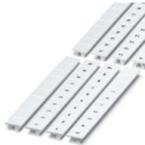
Zack marker strip, 10-section, horizontally labeled with the consecutive numbers: 11 ... 20, white, Width: 10 mm

Please be informed that the data shown in this PDF Document is generated from our Online Catalog. Please find the complete data in the user's documentation. Our General Terms of Use for Downloads are valid ( http://phoenixcontact.com/download )