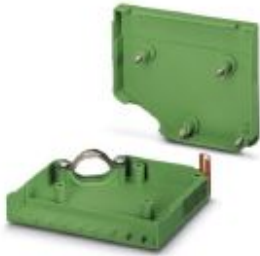
Cable housing, pitch: 0 mm, number of positions: 8, dimension a: 62.76 mm, color: green

Please be informed that the data shown in this PDF Document is generated from our Online Catalog. Please find the complete data in the user's documentation. Our General Terms of Use for Downloads are valid ( http://phoenixcontact.com/download )