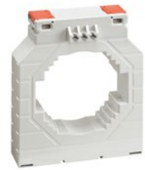
Current trasformers DM4T3000