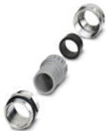
Brass screw connection, Pg16

Please be informed that the data shown in this PDF Document is generated from our Online Catalog. Please find the complete data in the user's documentation. Our General Terms of Use for Downloads are valid ( http://phoenixcontact.com/download )