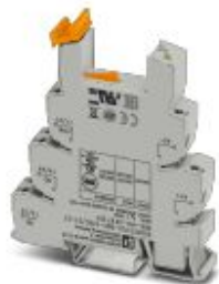
14 mm PLC basic terminal block with screw connection, without relay or solid-state relay, for mounting on DIN rail NS 35/7,5, 2 PDTs, input voltage 12 V DC

Please be informed that the data shown in this PDF Document is generated from our Online Catalog. Please find the complete data in the user's documentation. Our General Terms of Use for Downloads are valid ( http://phoenixcontact.com/download )