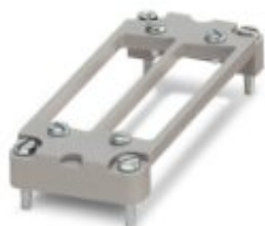
D-SUB adapter plate, for two D-SUB connectors, no. of positions 37, housing series HC-B 16...

Please be informed that the data shown in this PDF Document is generated from our Online Catalog. Please find the complete data in the user's documentation. Our General Terms of Use for Downloads are valid ( http://phoenixcontact.com/download )