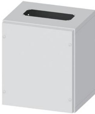
ALPHA 630, distribution box, IP55, Protection class 1, H: 350 mm, W: 300 mm, T: 250 mm, RAL 7035