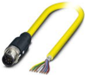
Sensor/Actuator cable, 8-position, PVC, yellow, shielded, Plug straight M12 SPEEDCON, A-coded, on Free cable end, Cable length: 10 m

Please be informed that the data shown in this PDF Document is generated from our Online Catalog. Please find the complete data in the user's documentation. Our General Terms of Use for Downloads are valid ( http://download.phoenixcontact.com )