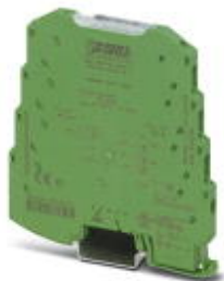
MCR repeater power supplies, screw connection, input signal: (0)4...20 mA, output signal: (0)4...20 mA

Please be informed that the data shown in this PDF Document is generated from our Online Catalog. Please find the complete data in the user's documentation. Our General Terms of Use for Downloads are valid ( http://phoenixcontact.com/download )