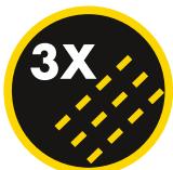
TRIPLE STITCHED SEAMS