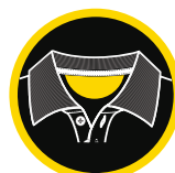
HALF MOON YOKE