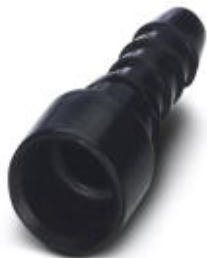
Pneumatic socket, for HC-M-PN3 module, internal hose diameter of 4.0 mm

Please be informed that the data shown in this PDF Document is generated from our Online Catalog. Please find the complete data in the user's documentation. Our General Terms of Use for Downloads are valid ( http://phoenixcontact.com/download )