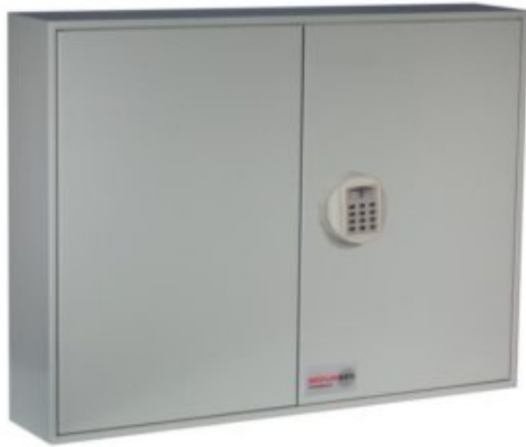
Deep System 200 Electronic Lock REVO A