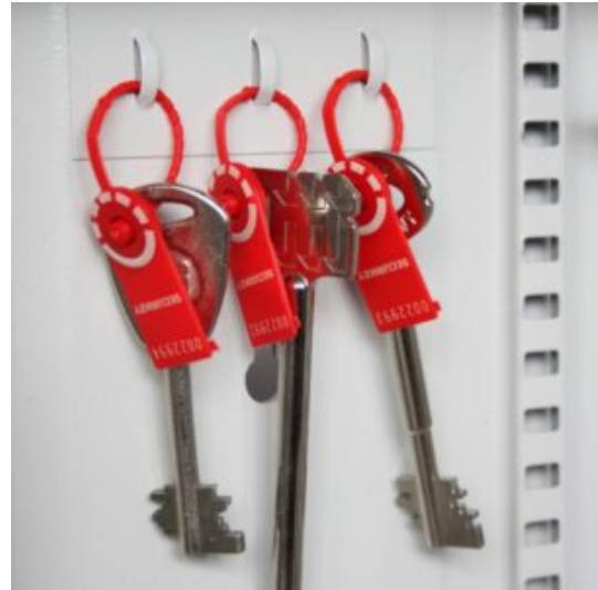
Security Seals & Loops