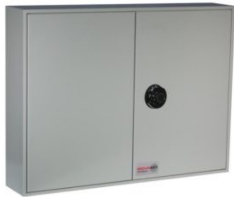
Deep System 200 Dial Combination Lock