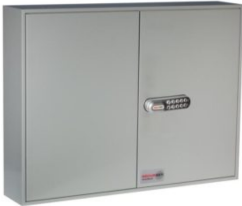
Deep System 200 Electronic Cam Lock CL1000