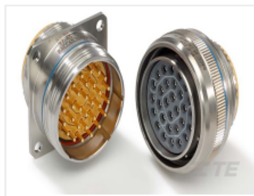
TE Part # ZPF00000000008506 983-6RS 22-55 SY-L