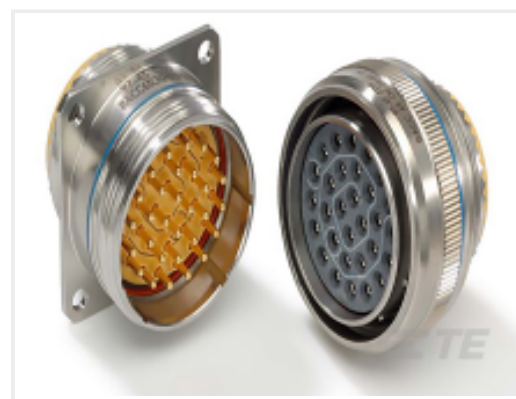
TE Part # ZPF00000000009076 983-6W 16-24 S6 L