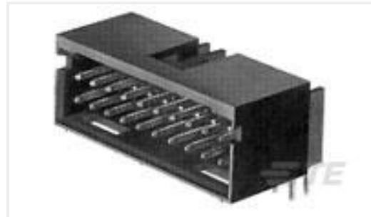
TE Part #5-103166-6 16 MODII HDR DRRA SHRD LF