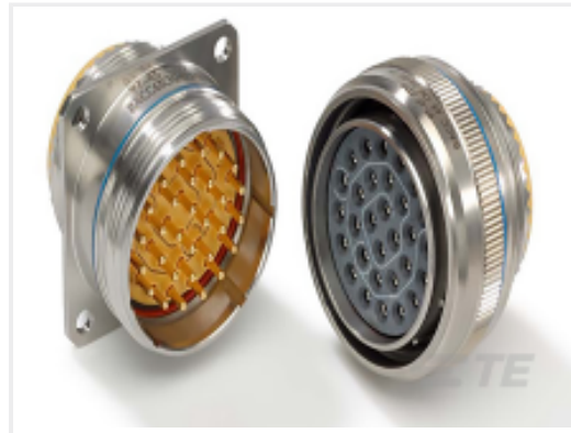
TE Part #ZPF000000000114505 983-0Y 14-07 PN 395