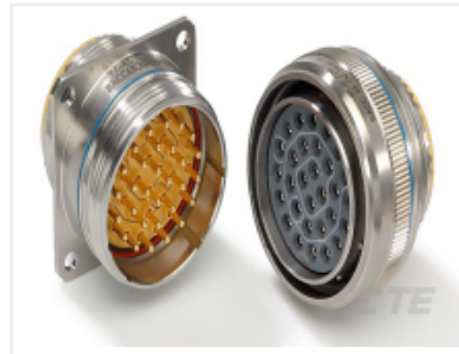
TE Part # ZPF000000000033005 983-ORS 20-41 S7 L