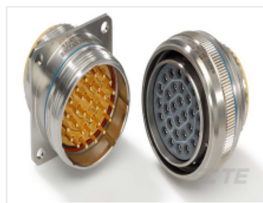
TE Part # ZPF000000000204962 983-15 S 2-14-15 SN