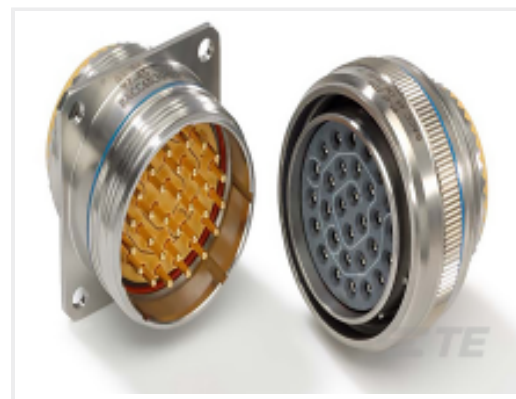
TE Part # ZPF000000000103592 983-6A 12-12 SN-L