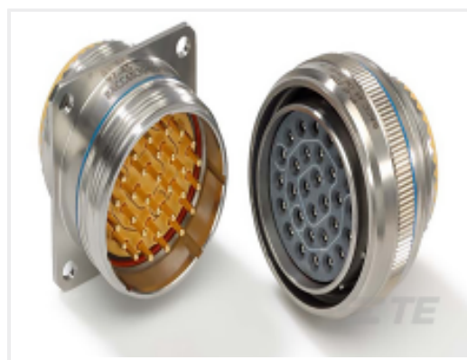
TE Part # ZPF000000000037697 983-6W 22-55 S6 L