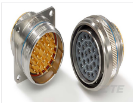
TE Part # ZPF000000000099494 983-ORS 22-39 S9 L