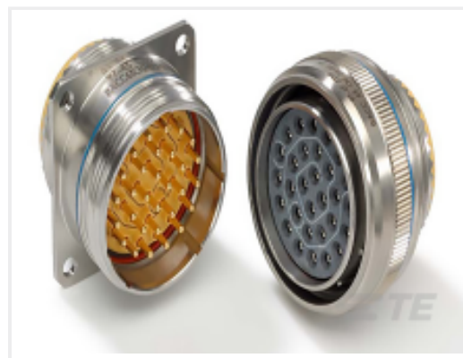
TE Part # ZPF000000000033007 983-ORS 20-41 S8 L