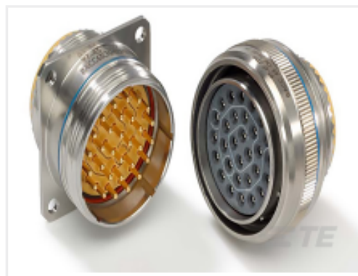
TE Part # ZPF000000000032921 983-ORS 18-31 S9 L