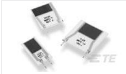
TE Part #1-1623776-5 MPC5 50R 5%