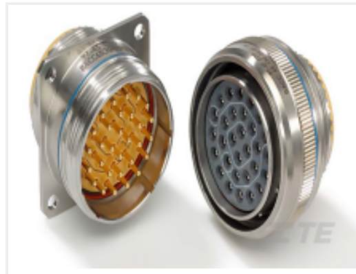
TE Part # ZPF000000000032917 983-ORS 18-31 S7 L