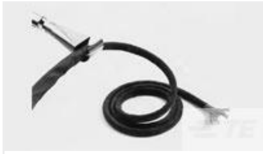
TE Part #CB7764-000 RW-200-1/8-0-SP