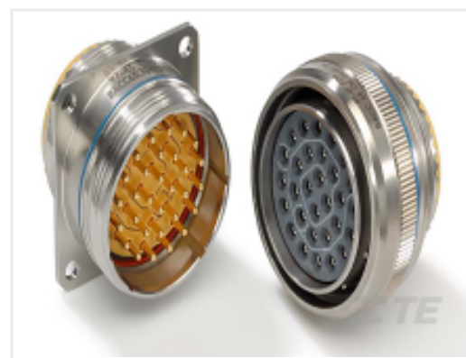
TE Part # ZPF00000000008504 983-6RS 22-55 S7 L