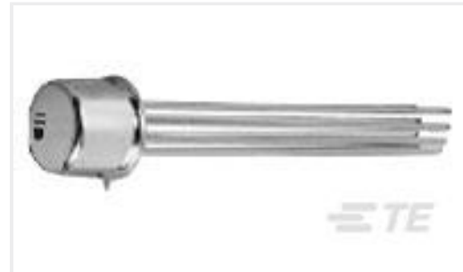
TE Part #1-1617122-0 JMACD-26XLS = M39016/15-105L