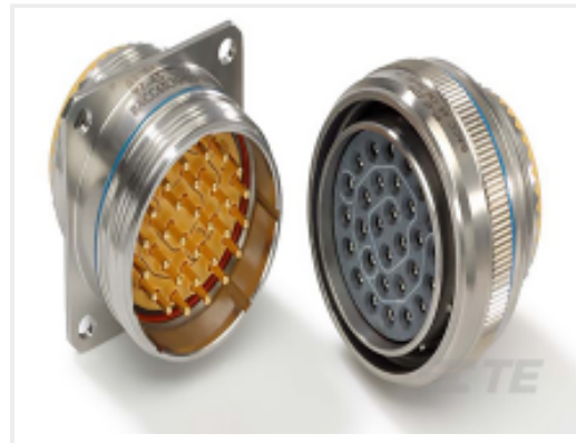
TE Part # ZPF000000000032993 983-ORS 20-39 S9 L