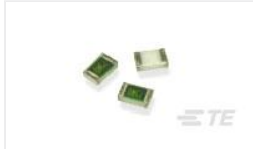
TE Part #1676330-2 RN 0805 3K65 0.1% 10PPM 1KRL