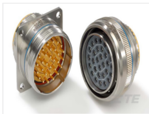
TE Part # ZPF00000000008342 983-6R 14-12 SN-L