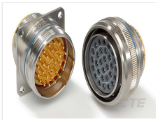
TE Part # ZPF000000000032812 983-ORS 14-12 S8 L