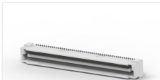
TE Part #CAT-313-PCB100 Free Height Plug Connector: Board-Board, Vertical, 100, 0.8mm