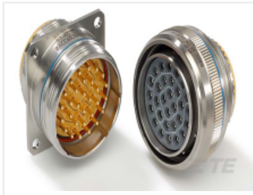
TE Part # ZPF000000000032919 983-ORS 18-31 S8 L