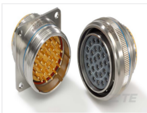
TE Part # ZPF00000000009067 983-6W 10-05 SN-L