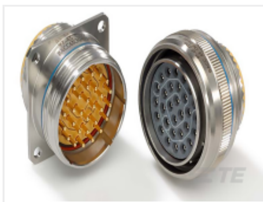
TE Part # ZPF00000000008396 983-6RS 10-05 S6 L