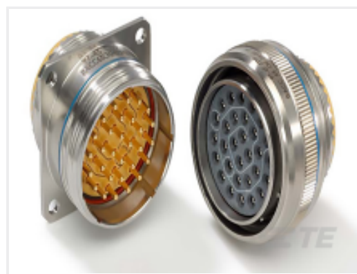
TE Part # ZPF000000000036034 983-6RS 10-05 S9 L