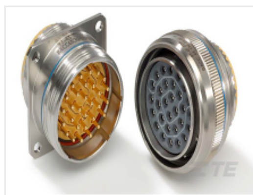
TE Part # ZPF000000000205833 983-15 K 7-10-05 SN