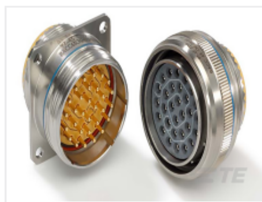
TE Part # ZPF000000000205834 983-15 S 7-10-05 SN