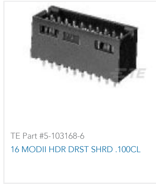
TE Part #5-103168-6 16 MODII HDR DRST SHRD .100CL