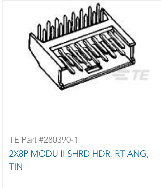
TE Part #280390-1 2X8P MODU II SHRD HDR, RT ANG, TIN