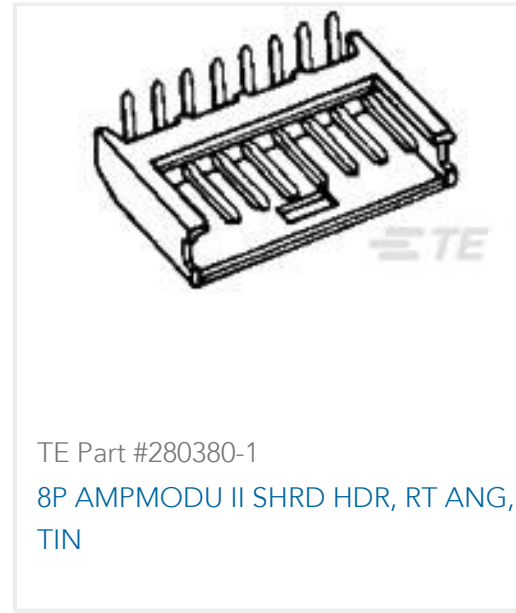
TE Part #280380-1 8P AMPMODU II SHRD HDR, RT ANG, TIN