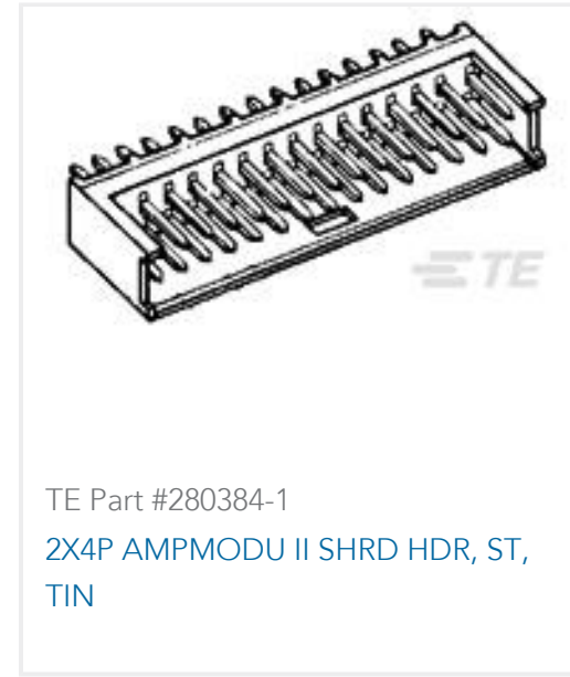
TE Part #280384-1 2X4P AMPMODU II SHRD HDR, ST, TIN