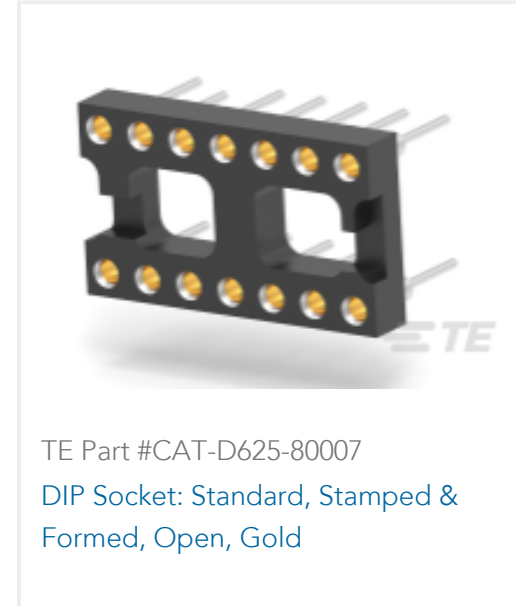
TE Part #CAT-D625-80007 DIP Socket: Standard, Stamped & Formed, Open, Gold