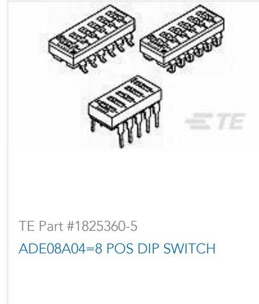
TE Part #1825360-5 ADE08A04=8 POS DIP SWITCH