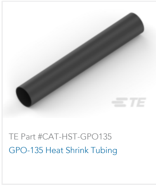
TE Part #CAT-HST-GPO135 GPO-135 Heat Shrink Tubing