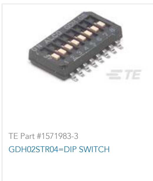
TE Part #1571983-3 GDH02STR04=DIP SWITCH