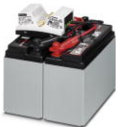
Energy storage device, lead AGM, VRLA technology, 24 V DC, 13 Ah, tool-free battery replacement, automatic detection, and communication with QUINT UPS-IQ

Please be informed that the data shown in this PDF Document is generated from our Online Catalog. Please find the complete data in the user's documentation. Our General Terms of Use for Downloads are valid ( http://phoenixcontact.com/download )