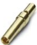
D-SUB crimp contact, connection method: Crimp connection, connection cross section: AWG 24- 20

D-SUB crimp contact - CUC-DSC-J1BAU-S/DSC24 - 1418788