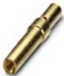
D-SUB crimp contact, connection method: Crimp connection, connection cross section: AWG 28- 26

D-SUB crimp contact - CUC-DSC-J1BAU-S/DSC28 - 1418787