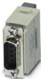
HEAVYCON socket contact insert module, D-SUB 9, crimp connection, for two conductors, without crimp contact

Please be informed that the data shown in this PDF Document is generated from our Online Catalog. Please find the complete data in the user's documentation. Our General Terms of Use for Downloads are valid ( http://phoenixcontact.com/download )