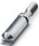
Coding peg for coding up to 16 connectors, for HC Modular