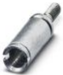
Coding socket for coding up to 16 connectors, for HC Modular