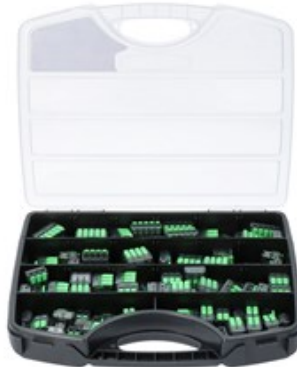
AS SC-2345 TL20