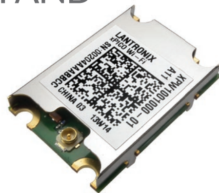
xPico Wi-Fi Actual Size

As one of the smallest embedded device servers in the world, xPico Wi-Fi can be utilized in designs typically intended for chip solutions, befitting in advantages to cost and time-to-market. Its “zero host load” eliminates any need for drivers on the connected microcontroller making implementation easy and fast with virtually no need to write a single line of code. This translates to considerably lower development costs and faster time-to-market. As xPico Wi-Fi meets FCC Class B, UL and EN EMC and safety compliance, your development time is shortened. xPico Wi-Fi can reduce the overall cost of ownership compared to the competition.