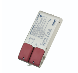
92200236499 POWERTRONIC INTELLIGENT PTI | 150/220...240 l