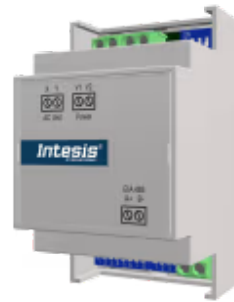
Bosch to Modbus - 1 indoor unit

The Bosch-Modbus interface allows full bidirectional communication between Bosch Commercial and VRF systems and Modbus RTU (RS-485) networks. The interface acts as a server device for the installation, accessing all signals from the air conditioner unit.