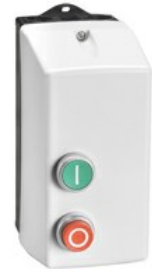
Empty enclosures M1PA