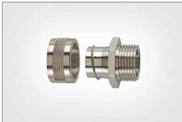
HelaGuard PCS-FM Fixed External Thread.