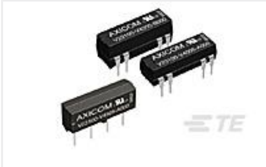
TE Part #4-1393763-0 V23100V4324C000

Product Drawings MPS203NPC PSHBTN DPDT English