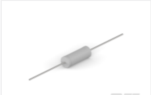
TE Part #3-2176412-0 5W XSM M/OX 5% 82R