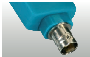
testo 206-pH3: pH3 probe head with BNC interface