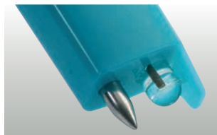
testo 206-pH1: pH1 probe head for liquids