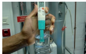
Ideally suitable for monitoring heating system water according to VDI 2035.