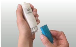
Easy exchange of probes with testo 206-pH1/-pH2/-pH3