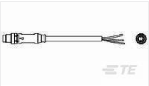
TE Part #2273002-1 M8 x 1.0 straight plug Pigtail