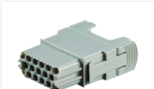
TE Part #T2111172201-000 HMN-017-F