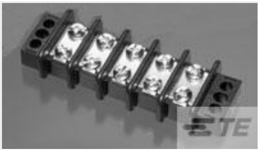
TE Part #1546307-2 2P .374" DR BARRIER,W/WASHER