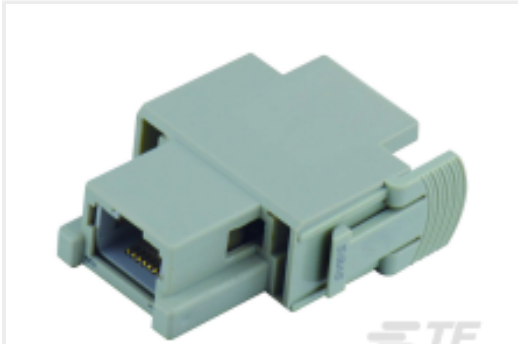
TE Part #T2113000201-000 HMN-RJ45-F