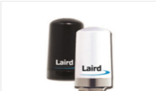
TE Part #TRAB24-49003P OMNI,Ph,2400/4900MHz BK,3 dBi, 60W,