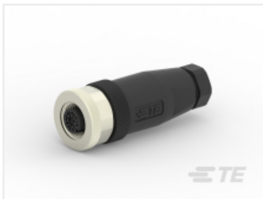
TE Part #T4110001081-000 M12,FEMALE,STRAIGHT,A CODE,8P, PG7,GOLD