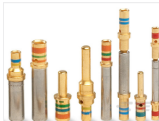
TE Part #2803-4-22143 CONT SOC ASSY