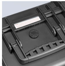
With pressure valve for venting and name plate