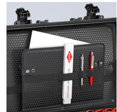
With document compartment