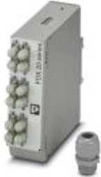
DIN rail splice box, fully mounted ready to splice, for 6x ST duplex (OM1)

Please be informed that the data shown in this PDF Document is generated from our Online Catalog. Please find the complete data in the user's documentation. Our General Terms of Use for Downloads are valid ( http://phoenixcontact.com/download )