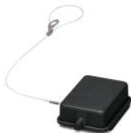
Protective cover B6, for single locking latch, protective cover material: PA, height: 18.5 mm, seal: no, diameter of retaining cord eyelet: 40 mm

Please be informed that the data shown in this PDF Document is generated from our Online Catalog. Please find the complete data in the user's documentation. Our General Terms of Use for Downloads are valid ( http://phoenixcontact.com/download )