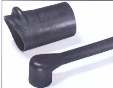
1123-1-G supplied / fully recovered.